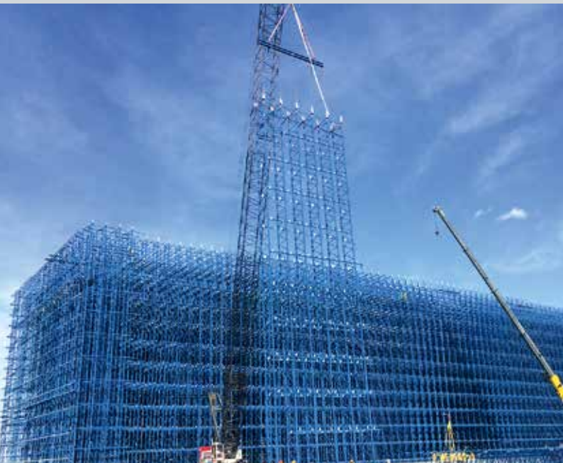
The logistically efficient, clad-rack structures are not yet as common in the US as they are in Europe.

When it comes to fire prevention, Preferred Freezer Services, a US provider of frozen goods logistics for the food industry, focuses on risk minimization rather than loss adjustment.