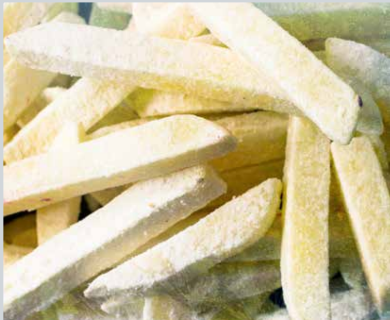
The frozen French-fries stored at Preferred Freezer Services' warehouse are now protected by WAGNER fire prevention technology.

The figures are impressive: three protected areas with a total volume of over 1.05 million cubic meters (± 40 million cubic feet), 35-meter-high (98.4') shelving systems, 117,000 pallet storage spaces and an order volume of over US$100 million.